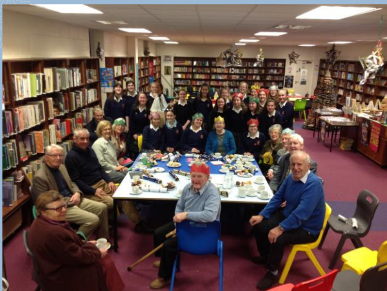
The Tech 4 U crew