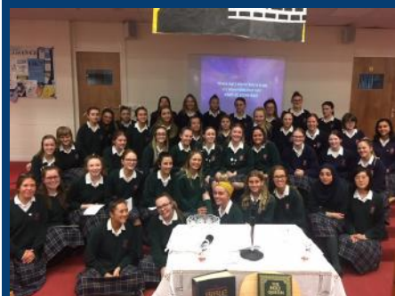
M House Mass