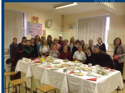
LCA Afternoon Tea

Well done to the TYs who were presented with their Junior Cycle Profile of Achievement on December 19 th . This certification represents the broad spectrum of their Junior Cycle experiences, documenting their exam results, descriptors for their Classroom Based Assessments as well as evidence of their Other Areas of Learning, including extra-curricular involvement.