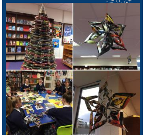
Christmas in the library