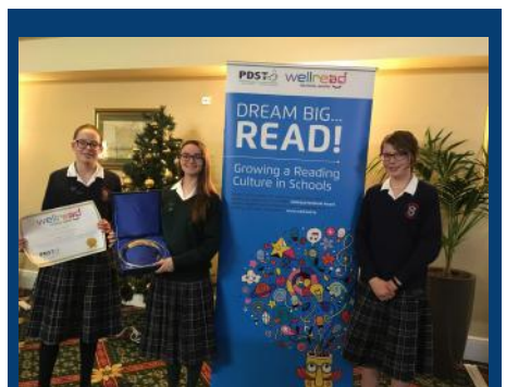
PDST Wellread National Award

The staff at OLS are spreading the joy of books throughout the school by displaying what they're reading on their classroom doors. The current reads take in a terrific range of genres, including classics, science fiction and historical fiction, from both Irish and international authors. We hope everyone has the chance to curl up with a good book over the Christmas break.