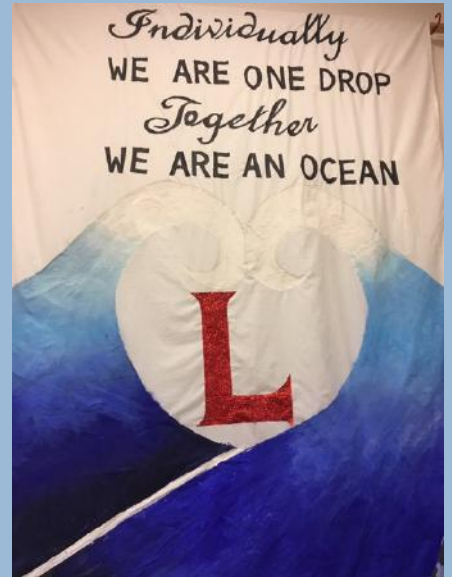
L House Mass