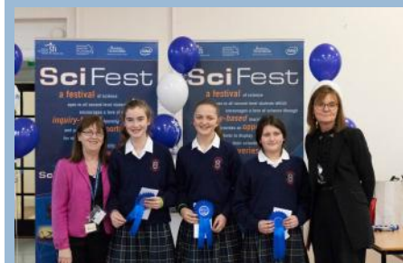
1 st place