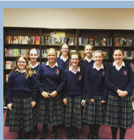
The library team