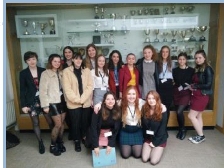
Model United Nations

The 2 nd Year debating team sailed through the first three rounds of the UCD Junior Schools Debating competition this term. The girls delivered their powerful speeches in UCD with great confidence. The standard of the competition was extremely high. The team are currently awaiting results for the knockout rounds which will continue in January.