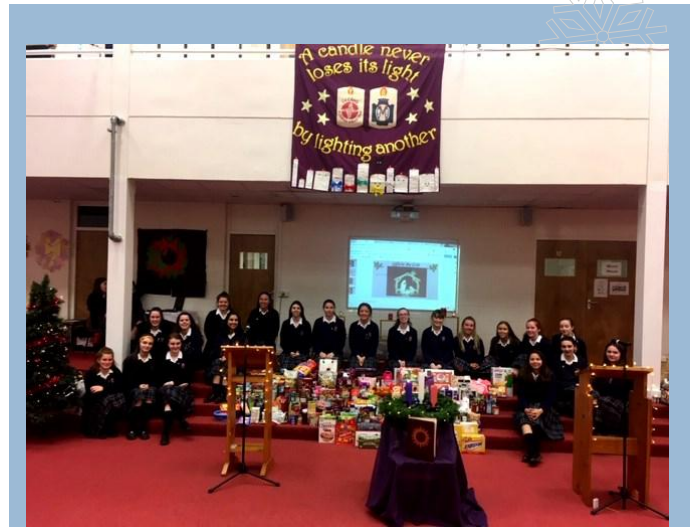
Gifts to the Crib