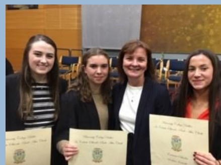
UCD Entrance Scholars