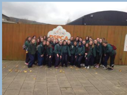
B3 at the DSPCA