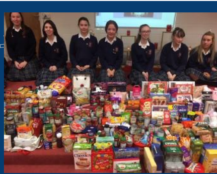
Gifts to the Crib

Thank you to all the staff, students and friends of OLS who have helped in these initiatives.