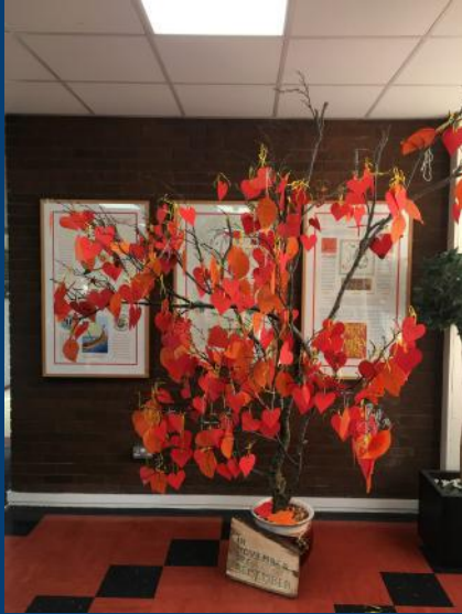
Tree of Remembrance