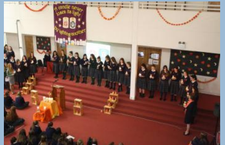
Foundation Feast Day Celebrations, November 23 rd