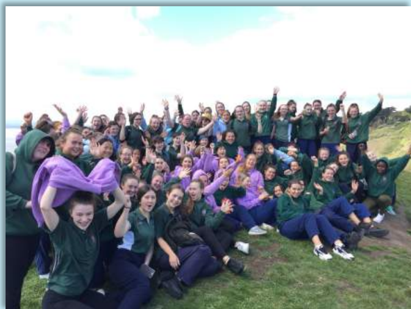
Rec Studies students on Howth Head