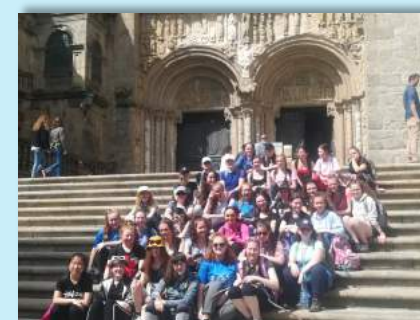
■ PAGE 4: TY Update