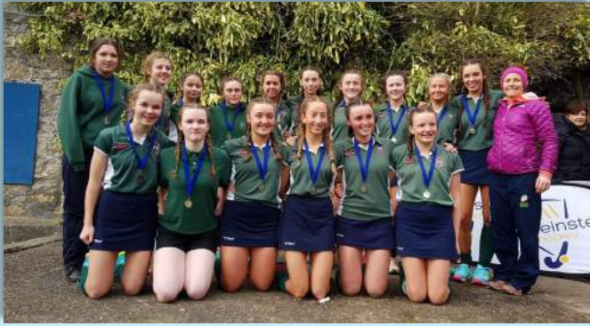
Junior A Hockey Team

The season ended as always with plenty of hoots and toots and we look forward to building on the success of this season next year. Best of luck to the 27 4th and 5th Year players who are heading to the USA on June 5 th for a hockey tour – we know they will do us all proud!