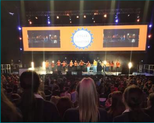
Student Leaders Congress

The TY students attended the Student Leaders Congress on Tuesday, April 9 th , in the 3Arena. The Congress is part of the Cycle Against Suicide School's programme, which aims to educate young people on issues of resilience, mental health stigma, positive attitudes towards mental health and coping mechanisms. The theme of this year's event was #PositiveVibesSuperLives. The girls got involved in the sing-alongs and particularly enjoyed the music section of the event where they were entertained by Kodakid and The Academic. The girls learned many useful tools, and heard from some fantastic speakers which no doubt will help them in developing positive and healthy attitudes to mental health.