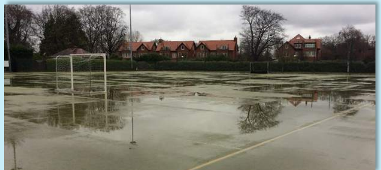
The reason we need to fundraise!