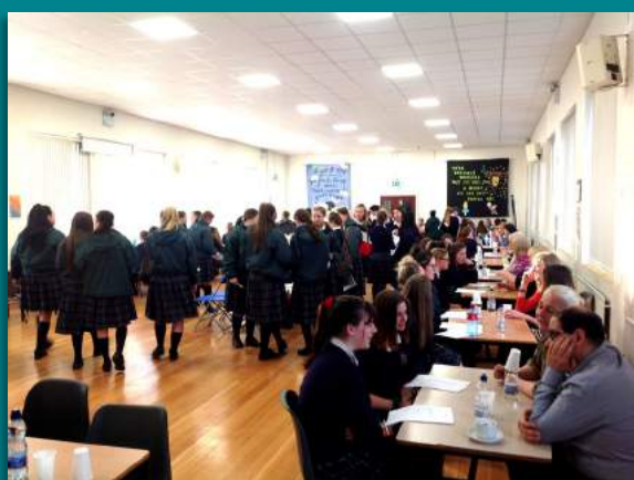
5th Year Careers Night