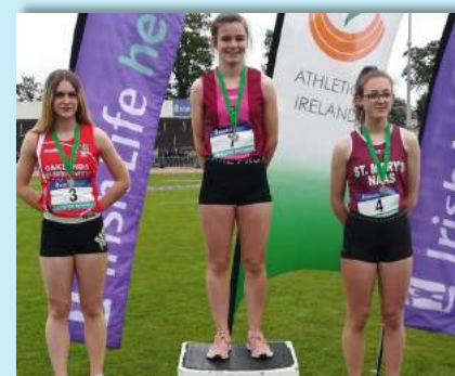
■ PAGE 10: Sport