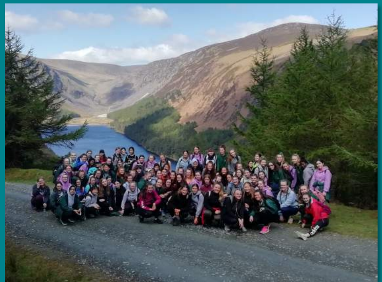
Gaisce Glendalough Hike