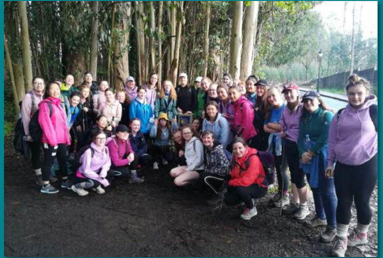
TY Pilgrims on the Camino

On May 3 rd 93 excited TY students headed off to Glendalough for their 2 day Adventure Journey as part of their Gaisce certification. After an enthusiastic sing-song on the bus journey down, all students dropped off their bags and got ready to hike. They completed a total of 16 kilometers on day one and then headed back to the hostel for the night. After the bedrooms were assigned, the beds were made, and all students had cooked their own dinners it was off to bed to be well rested for the second day of hiking. The next morning even the hailstones did not deter the students from packing their bags, donning their hiking gear, and setting off. Thankfully the skies cleared and the sun shone through out the hike. The students completed the final 9km of hiking and finished with a picnic in the sunshine. Well done to all who completed the hike and to those who have now completed their Gaisce Bronze Award qualification.