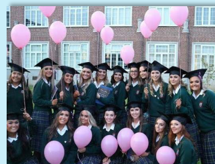
■ PAGE 3: 6th Year Graduation