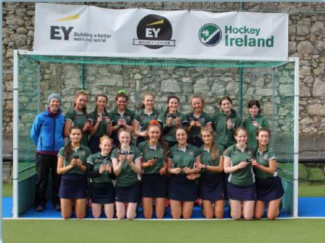
Senior B Hockey Team