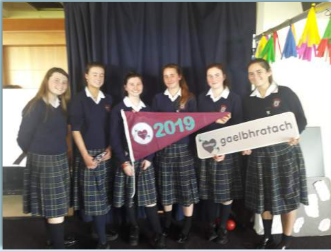
Coiste Gaeilge receiving their Gaelbhrtach