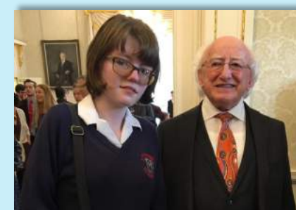
■ PAGE 8: Student Achievement