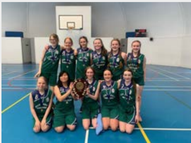
Congratulations to the Second-year basketball team who won 41-33 against Santa Sabina in the final.