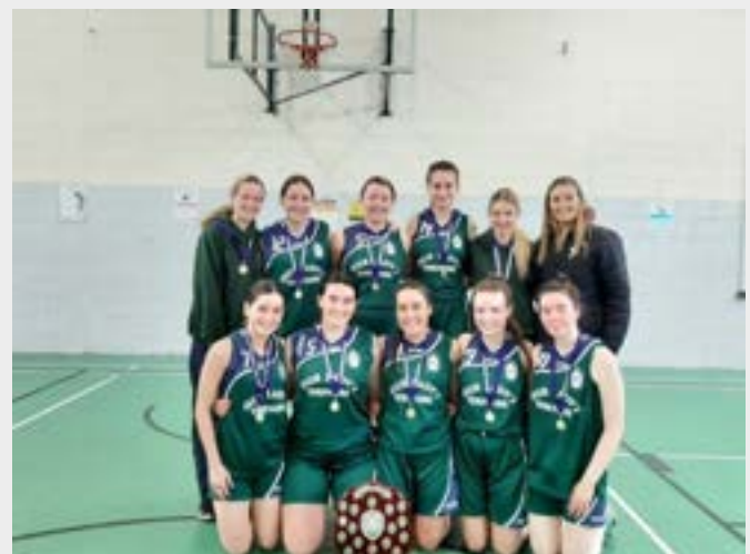
Well done to the senior basketball team who won the final 38-17 against Maryfield.